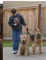
Shasta & Hamilton